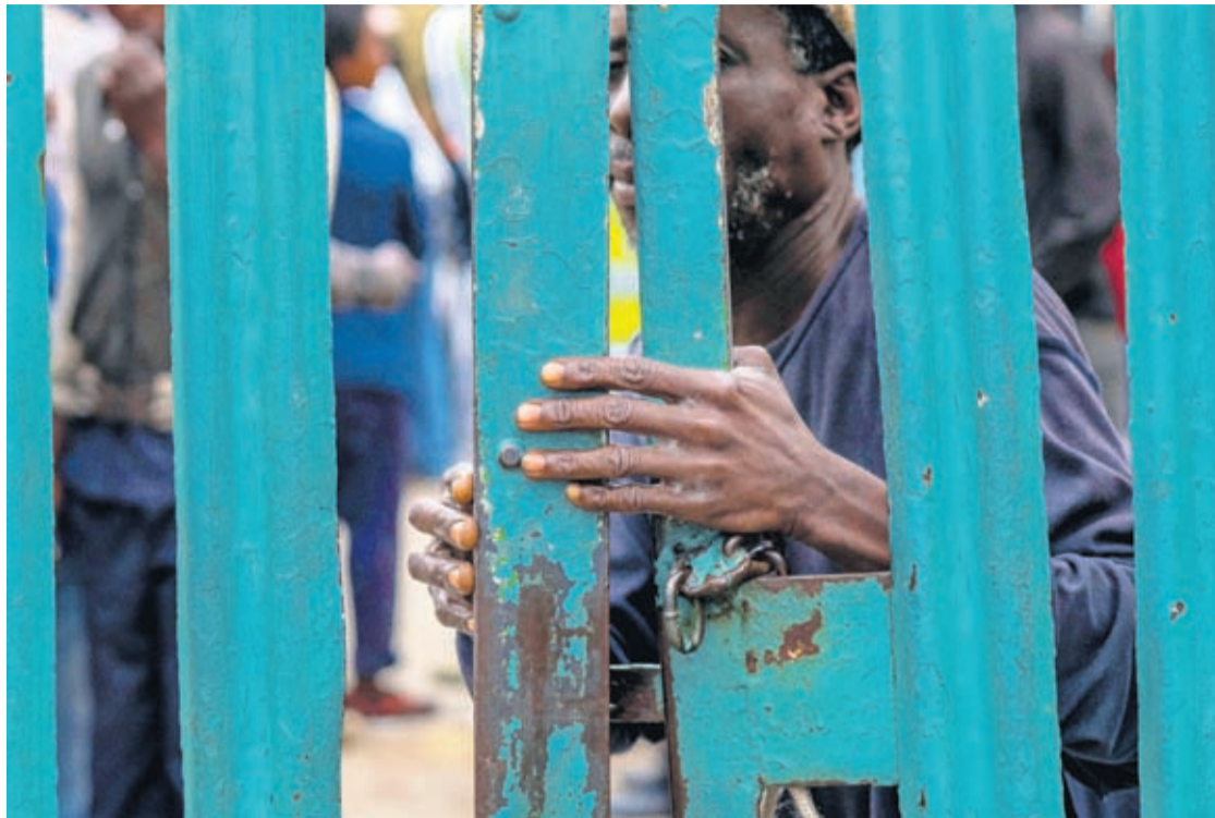
Homeless people stay at the Caledonian stadium downtown Pretoria, South Africa, Thursday April 2, 2020, after being rounded up by police in an effort to enforce a 21 days lockdown to control the spread of the coronavirus. Many of them being addicted, they are receiving methadone syrup from a local NGO, and were complaining about the lack of sanitizer and soap. The new coronavirus causes mild or moderate symptoms for most people, but for some, especially older adults and people with existing health problems, it can cause more severe illness or death.

"We've seen a lot of goodwill expressed to supporting Africa from bilateral and